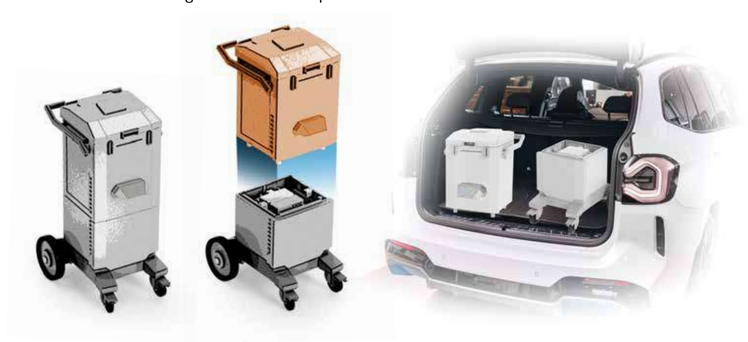
Transform your mobile OES into a table-top and operate directly via Mains supply

Tool-free design for detaching / re-attaching modules; designed to enable transportation even in a small car's boot!