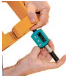
Equotip Bambino 2