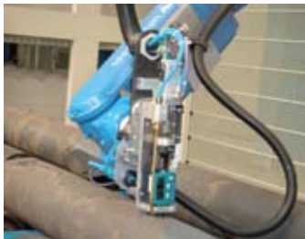
Equotip Piccolo 2

Equotip Piccolo 2 and Bambino 2 are supplied with a D impact device. It can be interchanged with an optional DL impact device, which is useful for measurements in restricted areas.